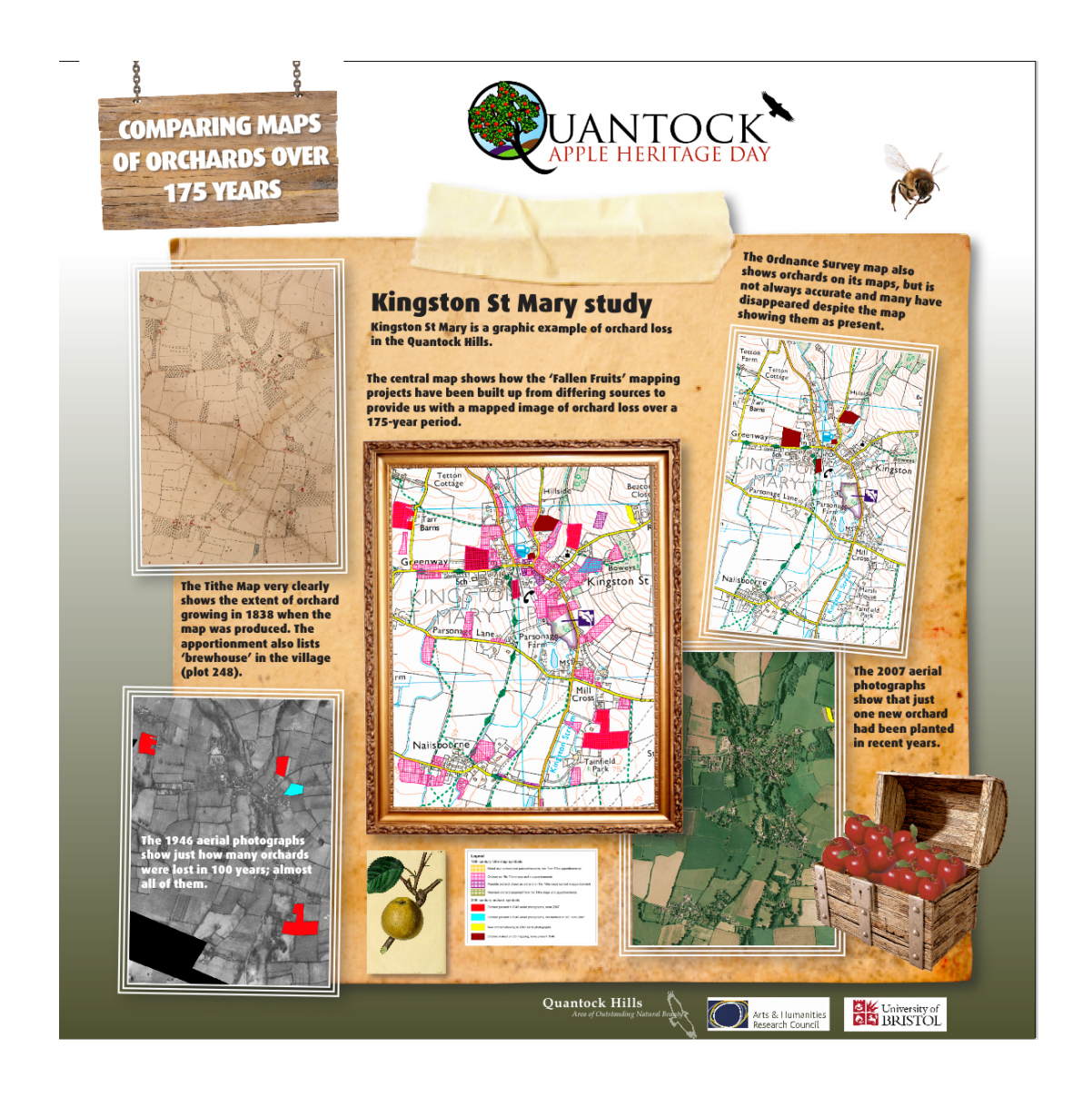
Figure 3. One of six display boards that presented the 'Fallen Fruits' project's research to the public on Quantock Apple Heritage Day,19 October 2013.

A third phase of the project, to disseminate the research findings more widely and through innovative means, was facilitated by AHRC follow-on funding. This final phase culminated with the first Quantock Apple Heritage Day (held at Fyne Court, Broomfield (a National Trust property and AONB Service headquarters). The event (19 October 2013), which brought together local apple growers, fruit tree nurseries, community orchards and cider collectives, apple experts (who provided an identification service), and poets with local, regional and national reputations, attracted an estimated 600 visitors (Coates, 2013). The occasion also gave the project team a platform to display its research to a large local audience in a visually appealing way, and to gather an extensive collection of site specific apple, orchard and cider memories and stories.